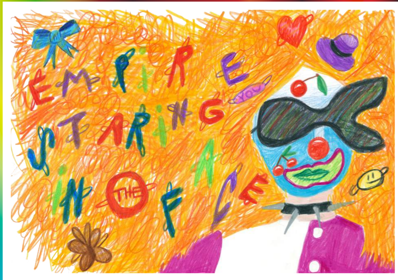
Old Put and Her Hair Clips , 2017