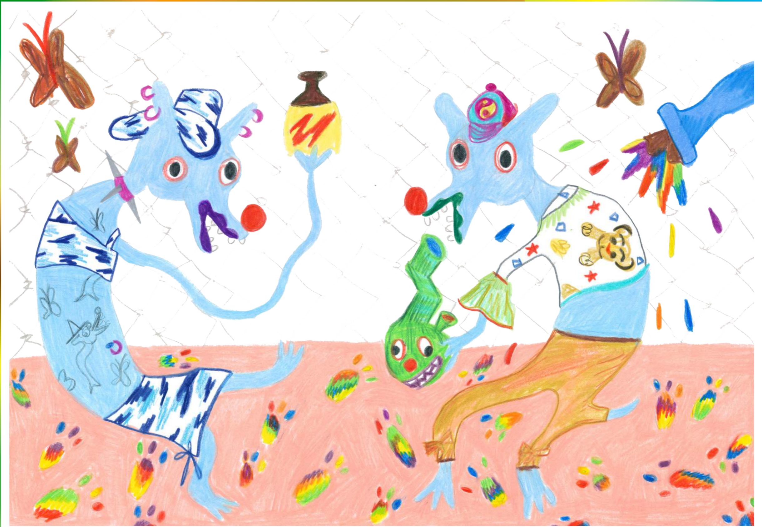
Pleather Puppy Party, 2017