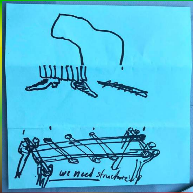
Hans Ulrich Obrist, exquisite corpse - Mileen Myles, Not Vital - Francis Kéré