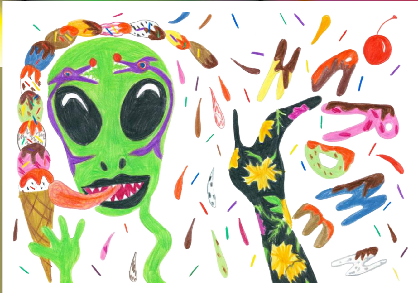
Crush the Alien Sundae, 2017