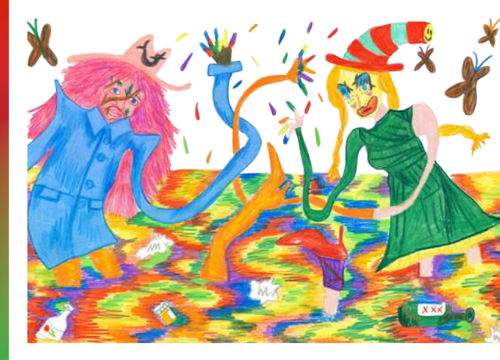
Two Old Puts Bathing , 2017