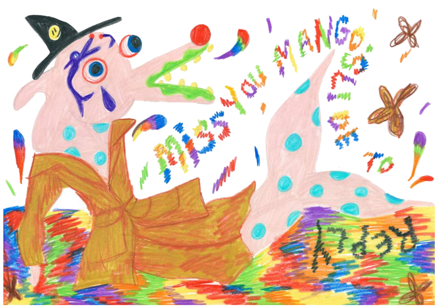
The Dolphin Witch Slipped, 2017