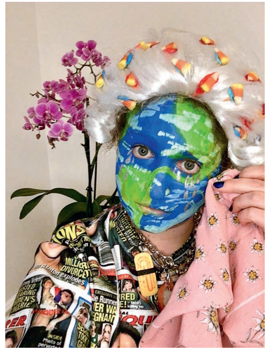
3 Top and Shorts . Maryam Nassir Zadeh Heels: Roger Vivier