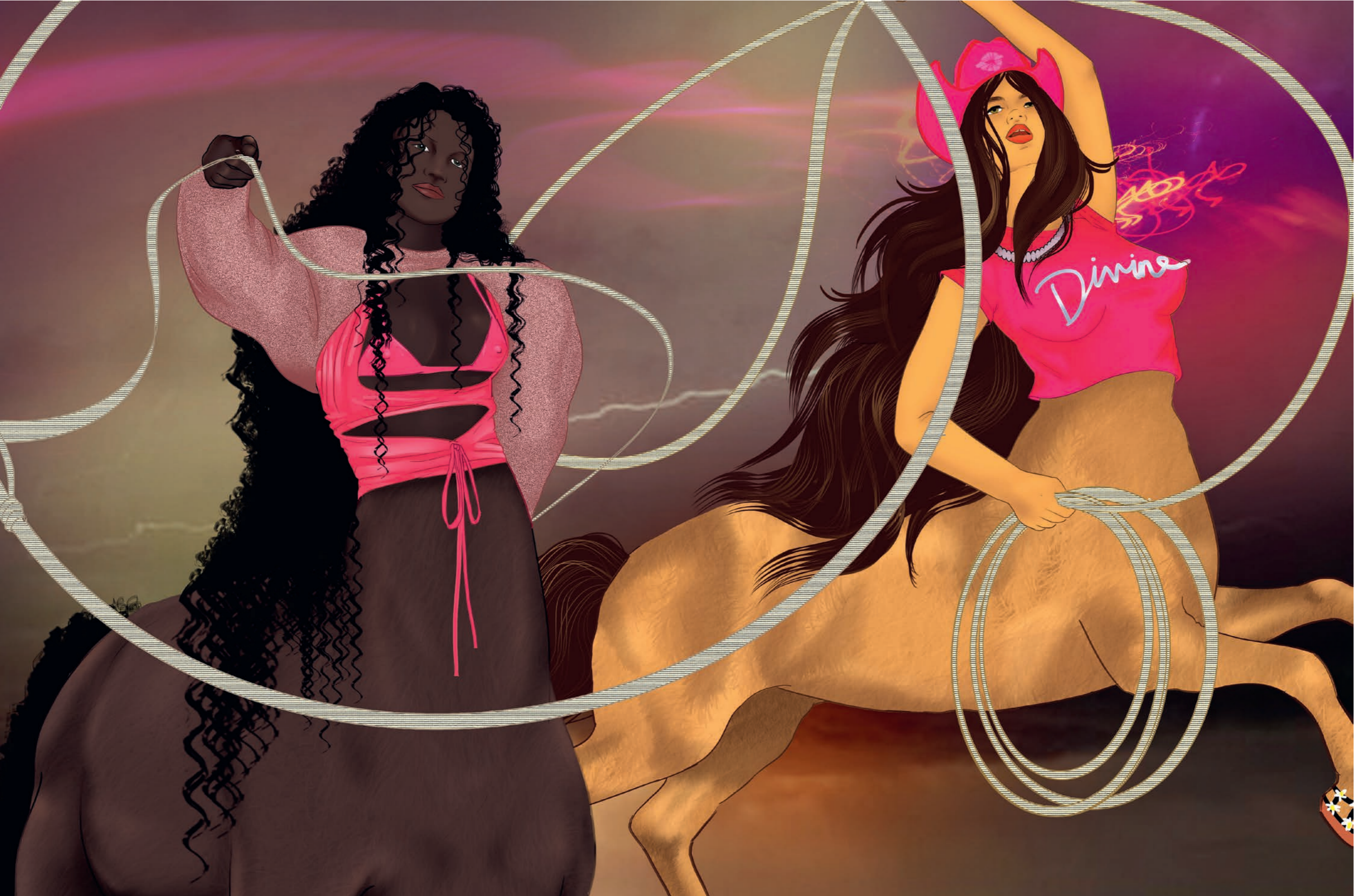
Fr0M left to right. SweaTer EsT3Ban Cortazar bikini Top I am Gia Hat & T-shirt Nico PanDA