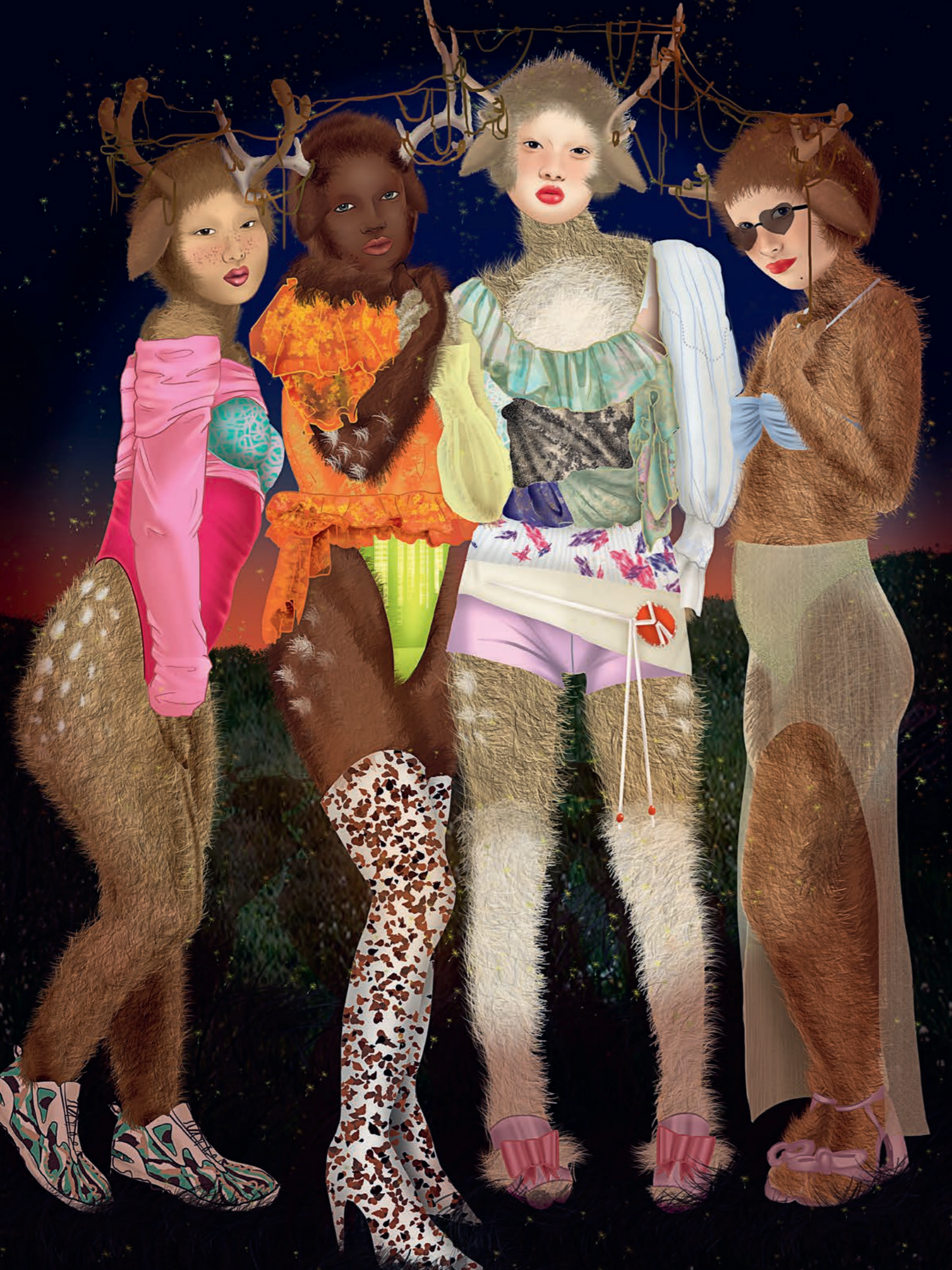
1 Swimsuit . Each x Other Top . Esteban Cortazar Trainers . Roberto Cavalli